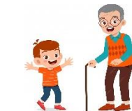
Growing from young to old