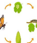
Nature life cycles