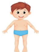
Outside body changes