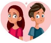
Boyfriend / girlfriend