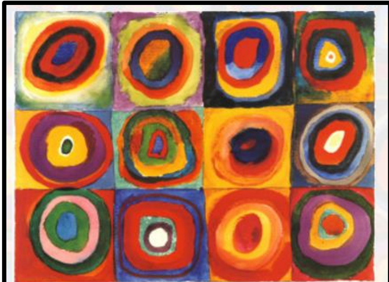
Colour Studies: Squares with Concentric Circles by Wassily Kandinsky

What do you see when you look at this painting?